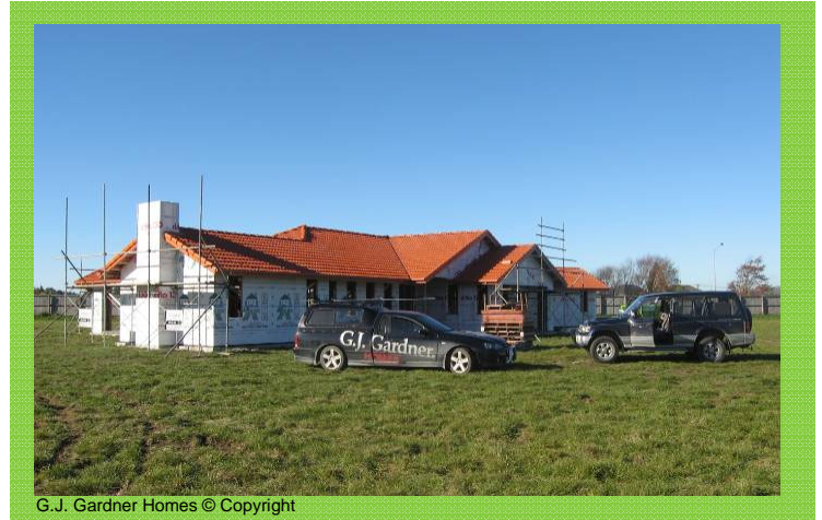
G.J. Gardner Homes © Copyright