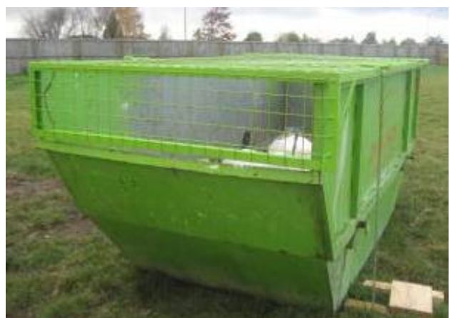
Skip with lockable lid to prevent unauthorised dumping in the skip