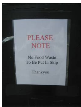
"No food waste" sign on skip