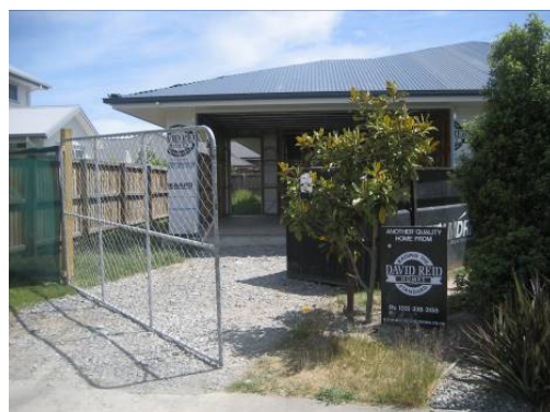
Fenced site to prevent unauthorised dumping in the skip