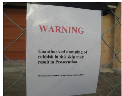
Sign on fence warning against unauthorised dumping