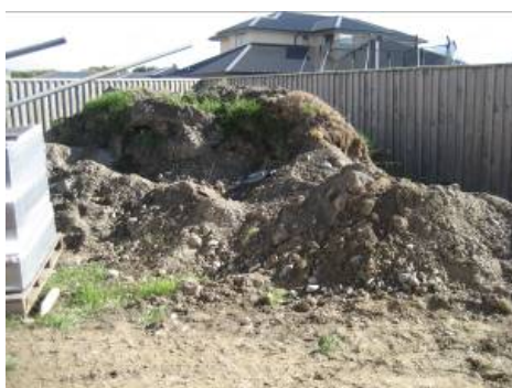
Soil stockpiled for reuse on-site