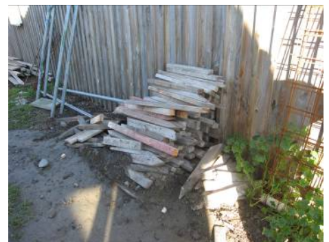
Timber off-cuts for reuse