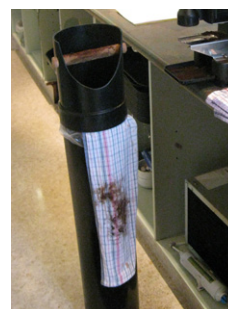
Coffee grounds collection in café