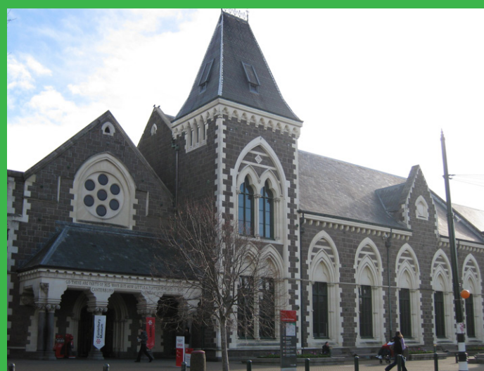
Canterbury Museum © Copyright

Expected HVAC electricity savings of 698,000 kWh or 56% per year