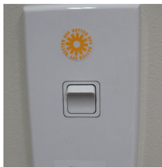
"Better Off" signage on light switches