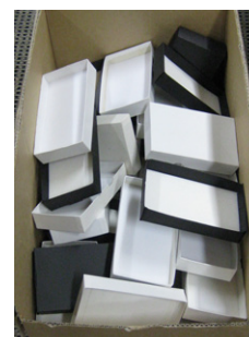
Surplus boxes collected for donation to other museums