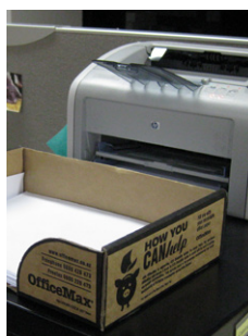
Paper recycling trays located at each desk